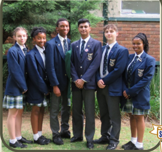
Girls and Boys Uniform

Please also restrict amount of shoes. Suitcases will be locked in a storage room and not be allowed in pupils rooms anymore so all their belongings must be tidy and organised inside of the wardrobes.